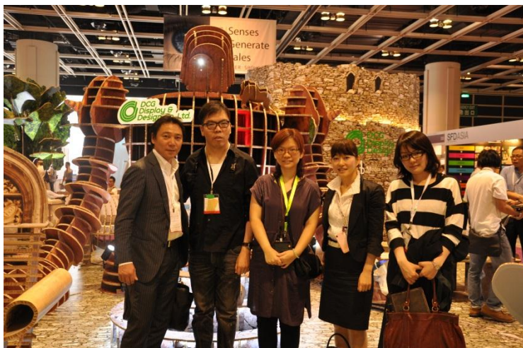
DCG Display & Design Company Limited Stand supported by Media By Phone

Stora Enso Re-board was invited to speak at the Retail Asia Expo in Hong Kong, hosted in the convention centre. The Expo attracted major brand owners and retailers from around the world over a three day period. There were several Re-board Partners with stands at the show, each reporting a high level of interest in Re-board. A Hong Kong TV Channel at the show was so impressed with the 'DCG Display & Design Company Ltd' stand featured below, that they decided to shoot a newsreel and interview the team there and then.